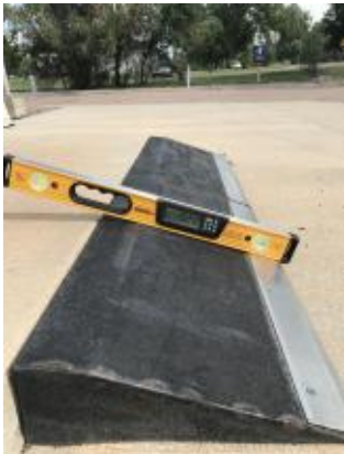
Finding 297746 Additional Photo