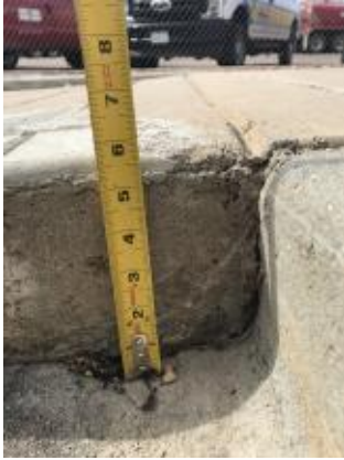
Finding 297747 Additional Photo