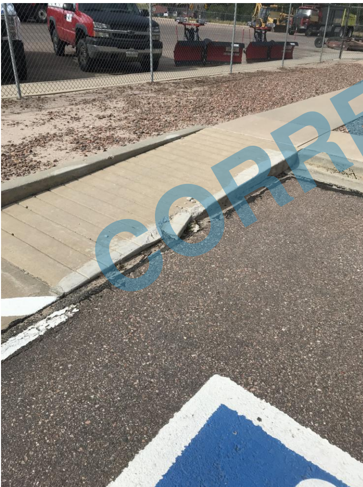
Finding 297747 Main Photo