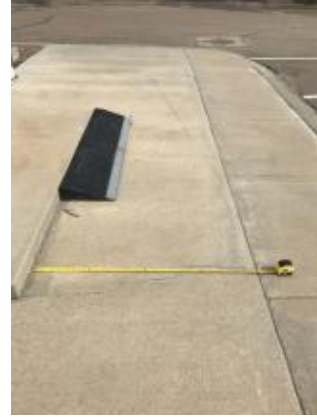
Finding 297746 Additional Photo