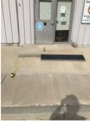
Finding 297746 Additional Photo