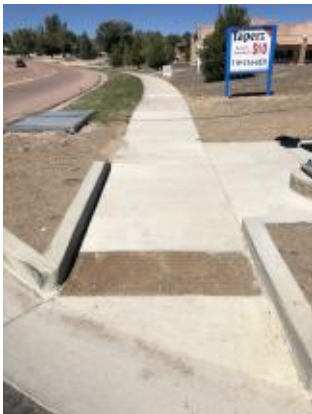
Finding 204417 Additional Photo