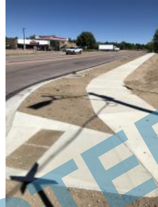
Finding 204417 Additional Photo