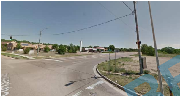
Finding 204417 Main Photo

Corrective Action: Department of Public Works submitted and completed 2 compliant curb ramps along with 215 linear feet of 6 feet wide detachable sidewalk on 8/31/2018