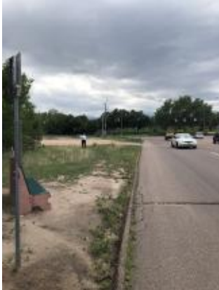
Finding 204417 Additional Photo