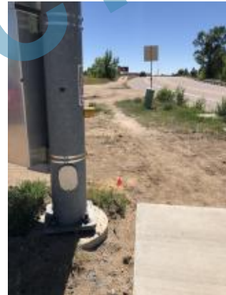
Finding 204417 Additional Photo