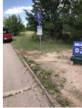
Finding 204417 Additional Photo