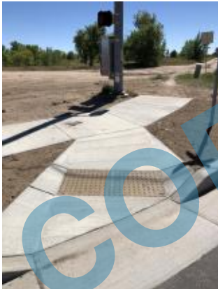
Finding 204417 Additional Photo