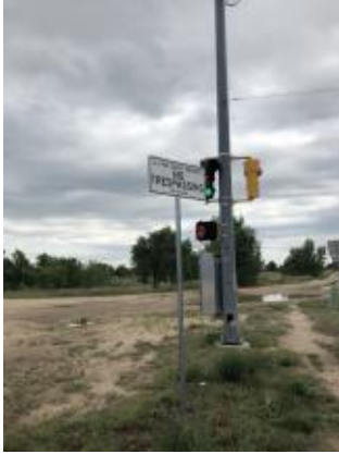
Finding 204417 Additional Photo