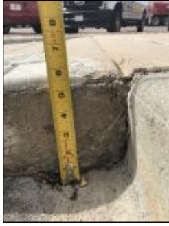
Finding 297747 Additional Photo