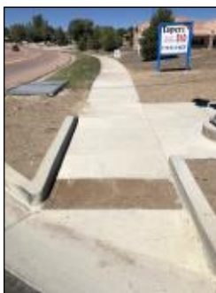
Finding 204417 Additional Photo