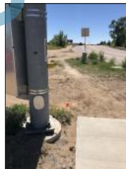
Finding 204417 Additional Photo