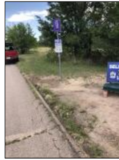
Finding 204417 Additional Photo