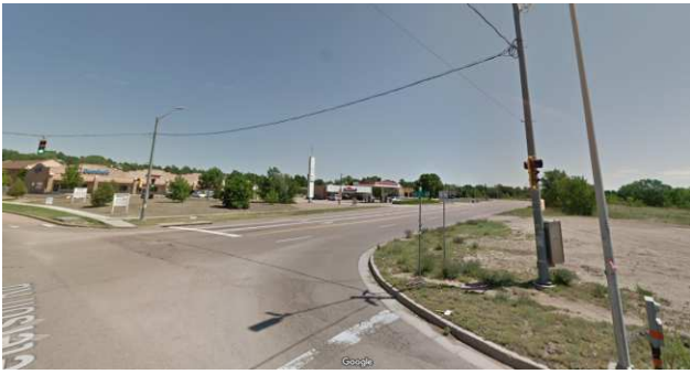
Finding 204417 Main Photo