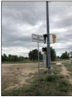
Finding 204417 Additional Photo