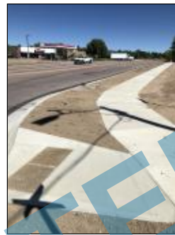
Finding 204417 Additional Photo