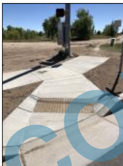
Finding 204417 Additional Photo