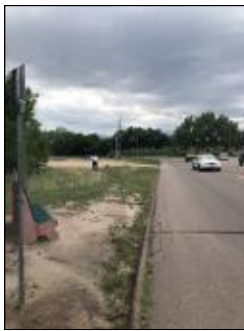
Finding 204417 Additional Photo