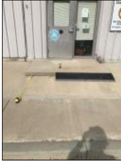
Finding 297746 Additional Photo