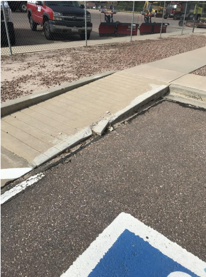
Finding 297747 Main Photo