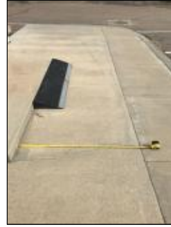
Finding 297746 Additional Photo