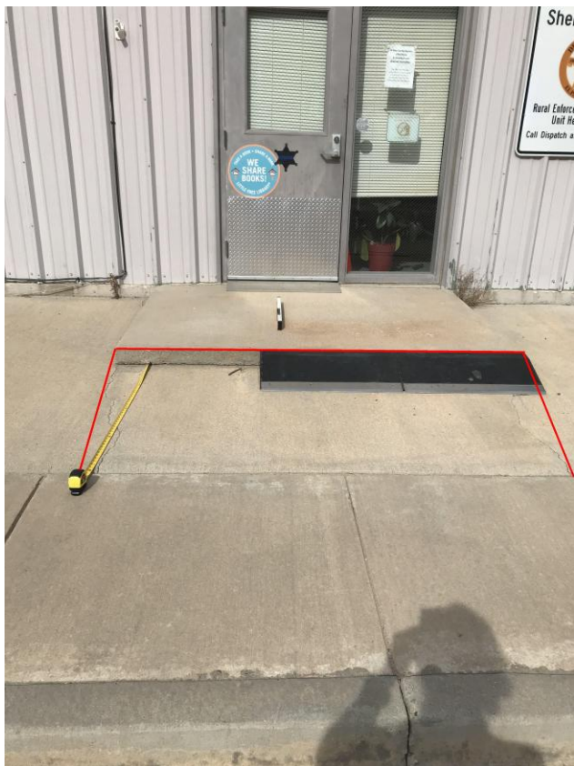
Finding 297746 Main Photo