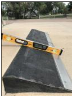
Finding 297746 Additional Photo