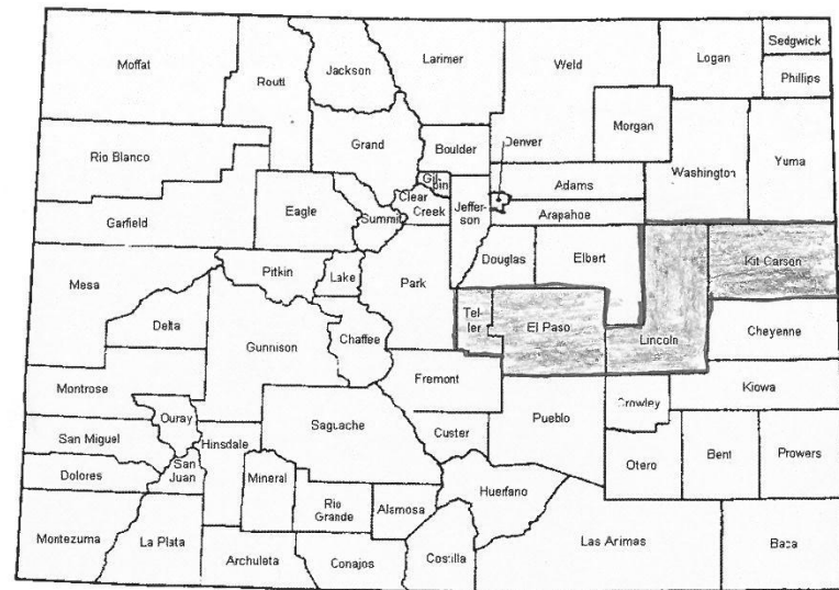
4 th Judicial District in 1965