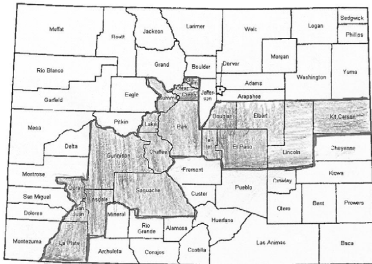
4 th Judicial District in 1900